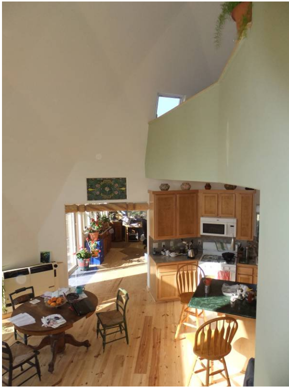
Dining room and sunroom