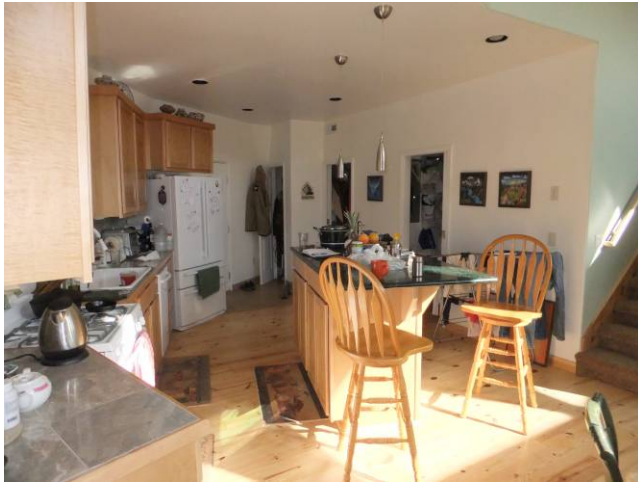
Kitchen and pantry door