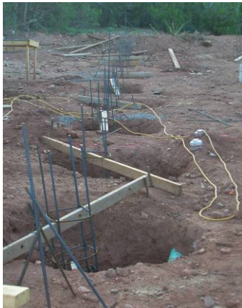
First, the pads for the columns