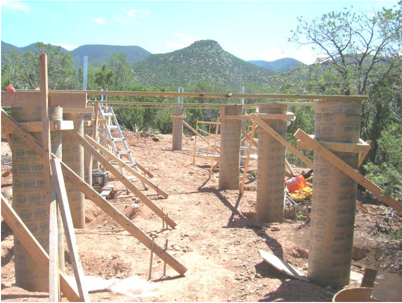
Column forms ready to pour