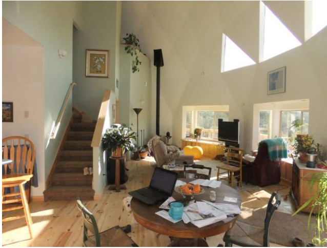
Living room, stairs up, kitchen to the left.