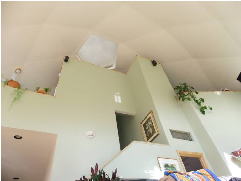
loft, cupola and rooms on either side,

I am happy to share more information with anyone who is interested. Please feel free to contact me at sbresolana@gmail.com .