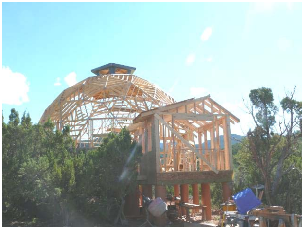
All framed up with blocking in