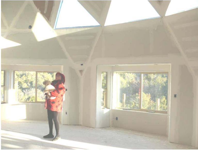
Drywall in- bay windows in background