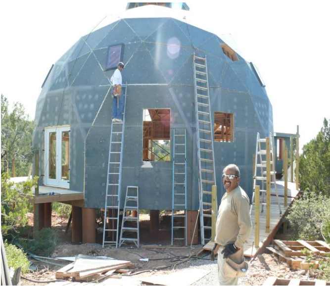
Panels on, windows and doors going in.