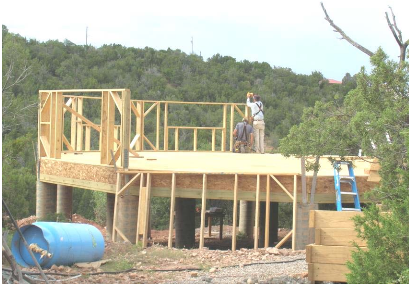
First kit pieces-risers