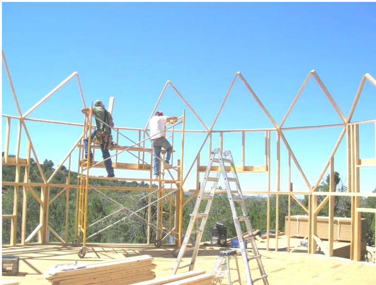
Then the individual compound cut triangle pieces. One at a time...